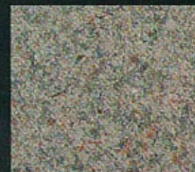
068 River Rock