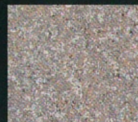
005 Field Stone