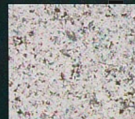
572 White Vein