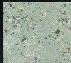
594 Great Lakes